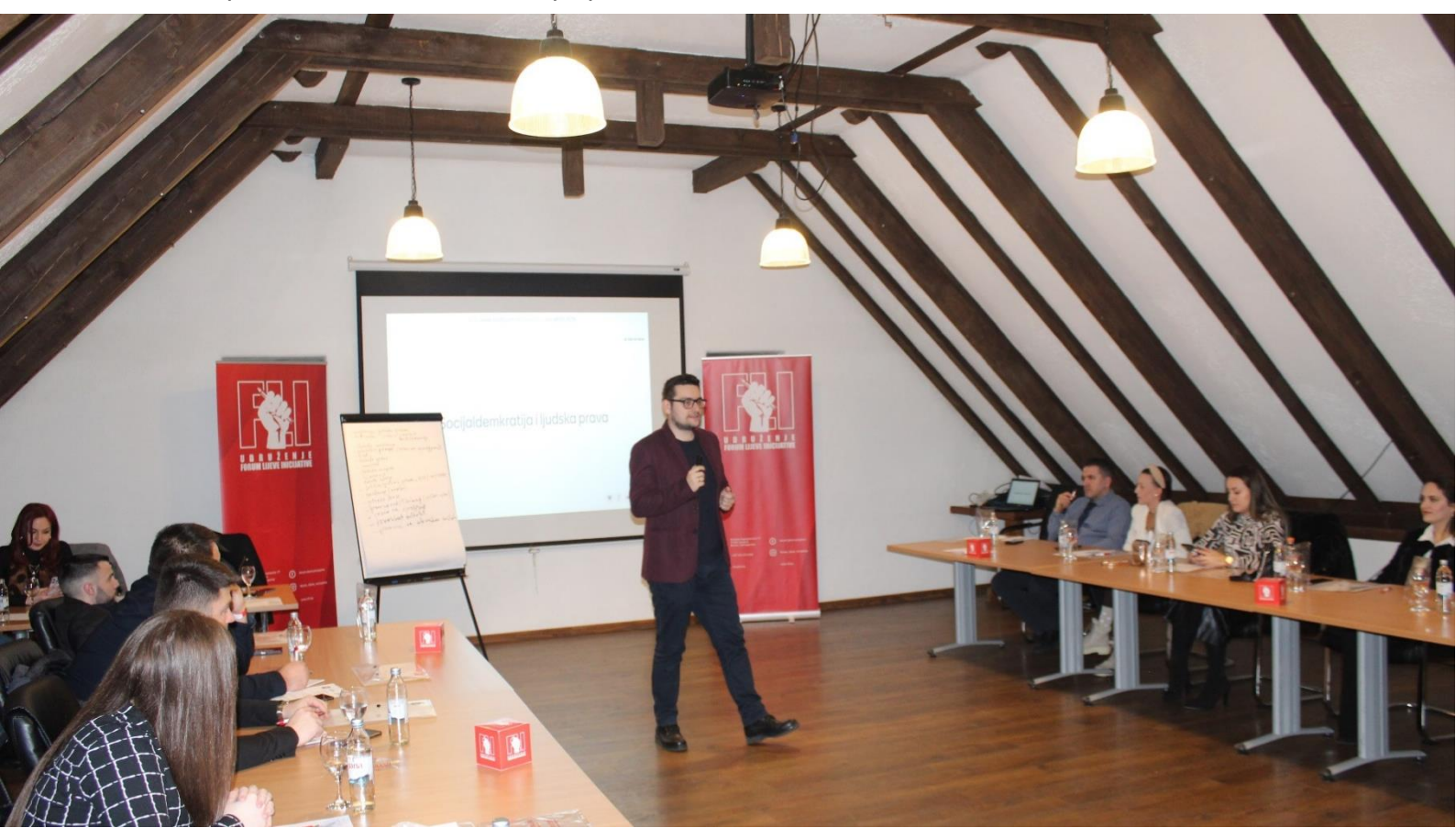
Figure 7 : Party capacity training, Bosnia and Herzegovina (March 2023)

parliaments. The central topic of each podcast was the search for practical applications of social democratic values in the field of human rights and improvement of the position of the LGBTQ+ population.