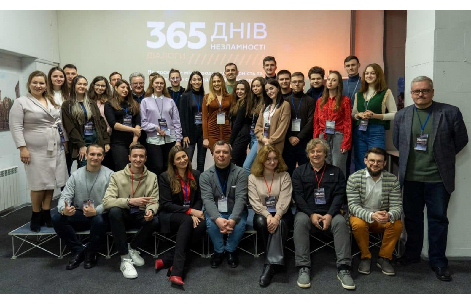
Figure 2: SD Platform roundtable participants on a social democratic vision for post-war Ukraine, Ukraine (March 2023)