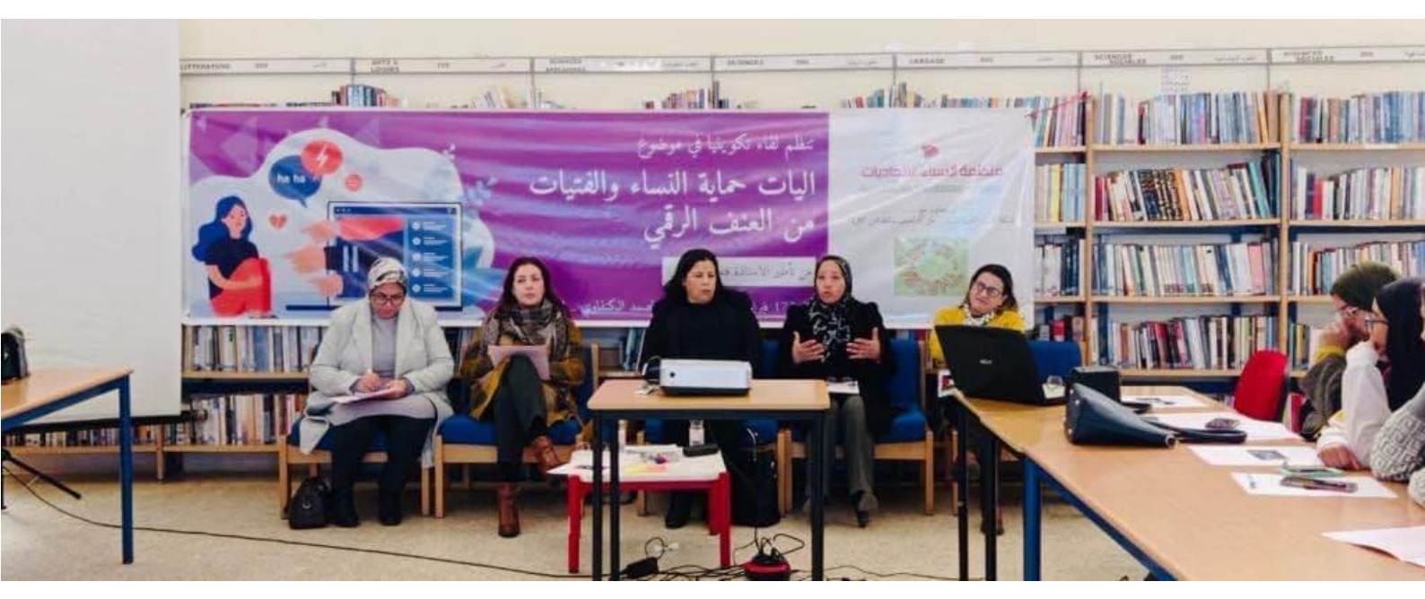
Figure 4: Women's Political Leadership Training, Morocco (March 2023)