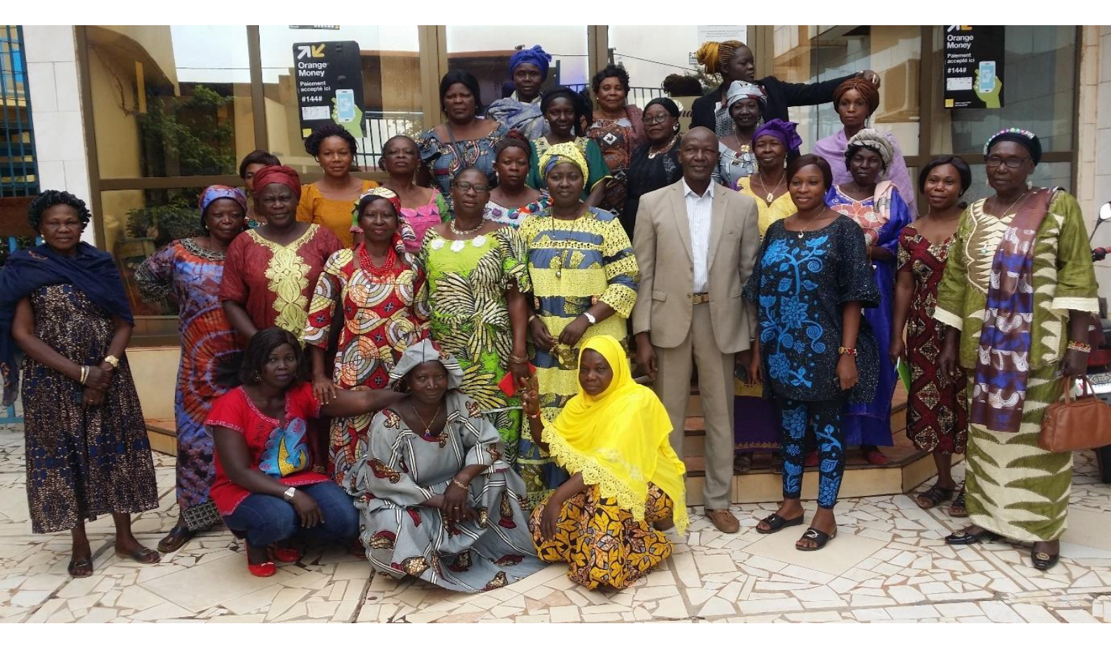
Figure 1: Participants at the Women's Academy for Africa National Workshop, Central African Republic (November 2022)

The Labour Party supports political parties in new and emerging democracies around the world through its Westminster Foundation for Democracy Programme – a key component of Labour's international strategy.