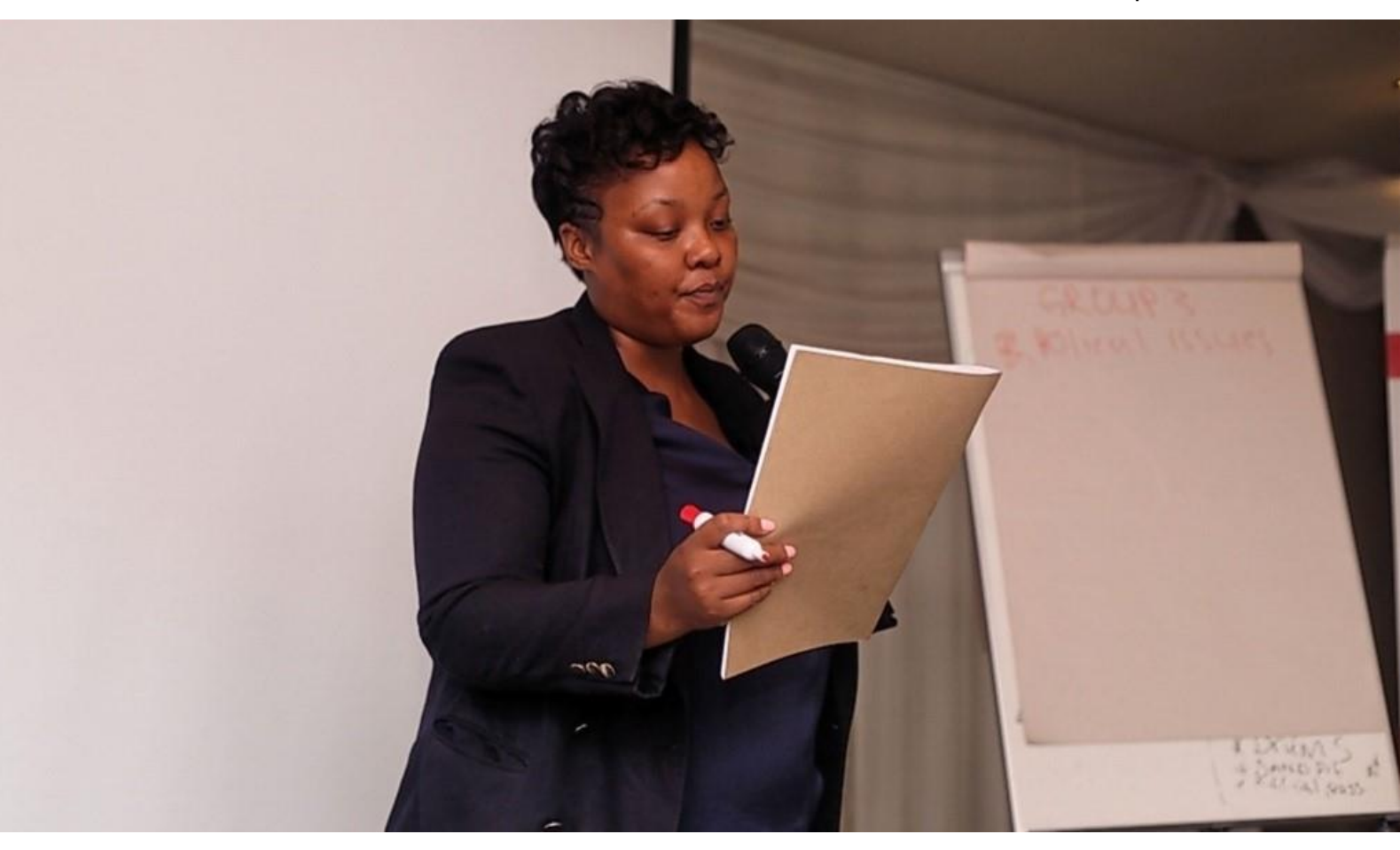
Figure 3: Women's Academy for Africa National Workshop, South Africa (November 2022)